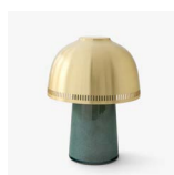
→ Blue Green & Brass