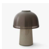
→ Beige Grey & Bronzed