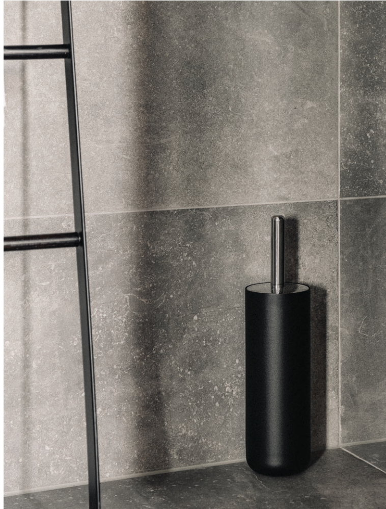
TOILET BRUSH Designed by Norm Architects