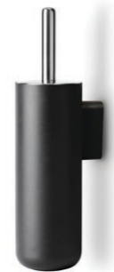
BLACK, WALL 7710559